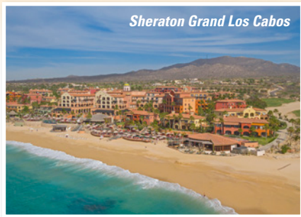
Sheraton Grand Los Cabos