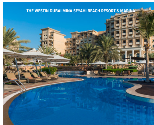
THE WESTIN DUBAI MINA SEYAHI BEACH RESORT & MARINA