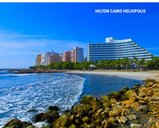
HILTON CAIRO HELIOPOLIS