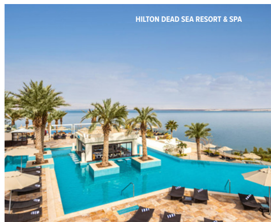
HILTON DEAD SEA RESORT & SPA